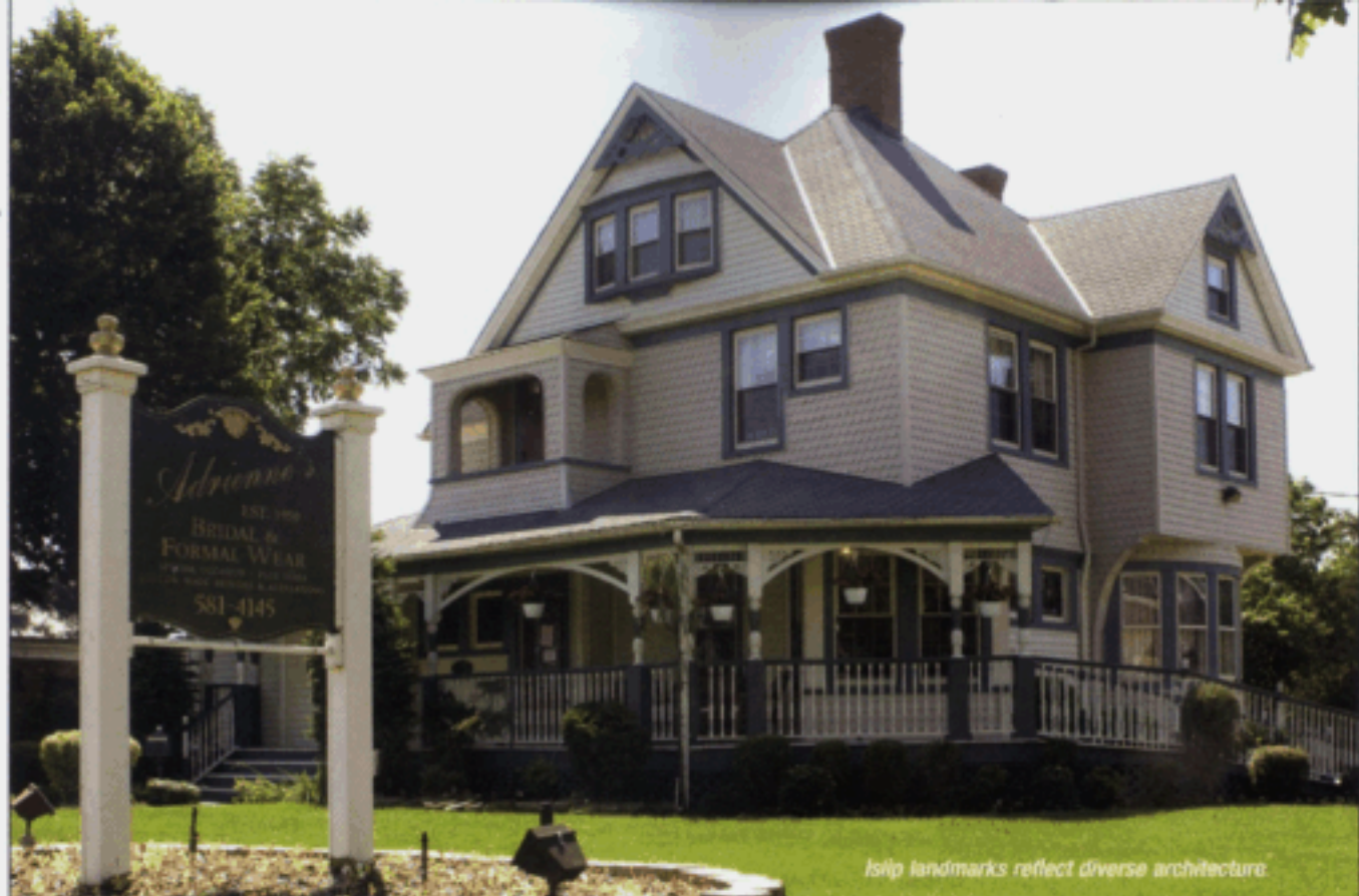
Islip landmarks reflect diverse architecture.