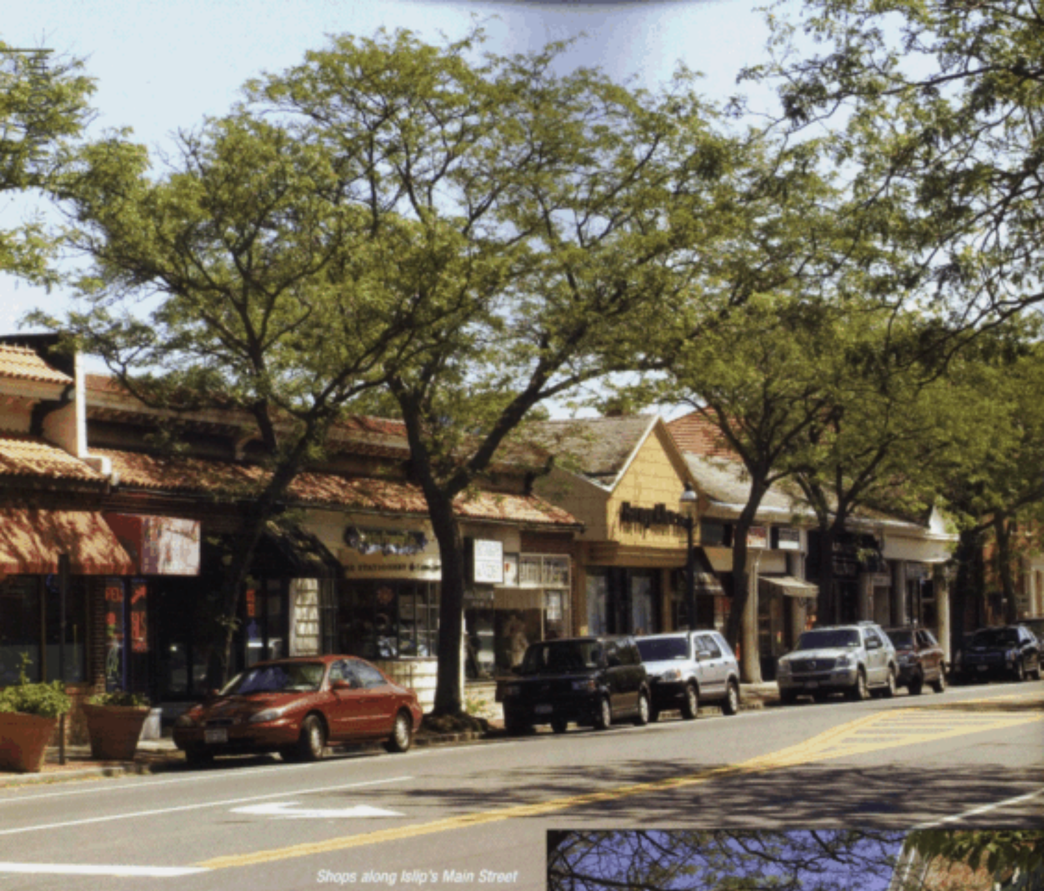
Shops along Islip's Main Street

community. That's because they're quite distinct from one another in terms of character as well as geography.